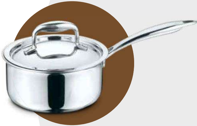
PLATINUM SAUCEPAN (WITH LID/INDUCTION-FRIENDLY)