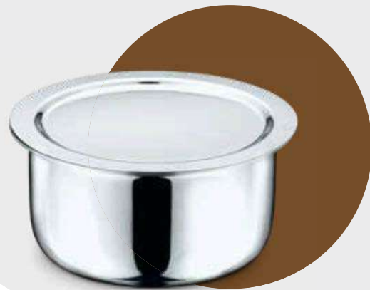
PLATINUM SAUCEPOT (WITH LID/INDUCTION-FRIENDLY)