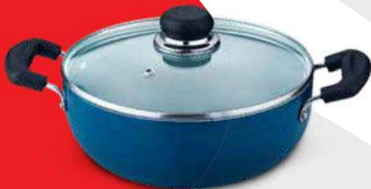
ZEST CASSEROLE (WITH LID)