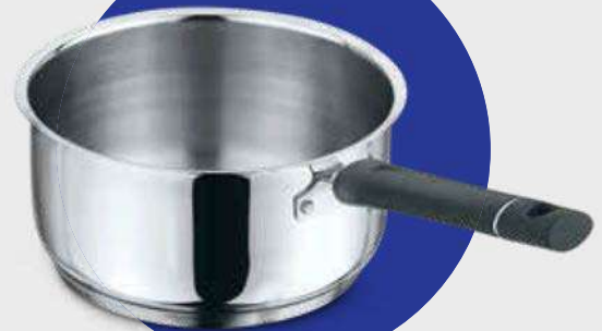
REGULAR SAUCEPAN (INDUCTION-FRIENDLY)