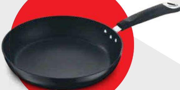
BLACK PEARL NON-STICK FRYPAN (INDUCTION-FRIENDLY)