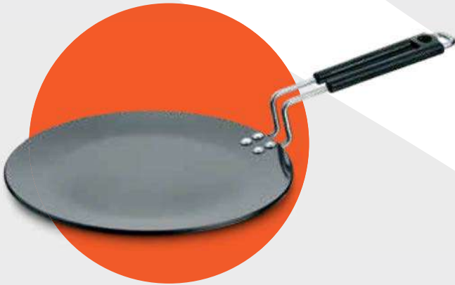
BLACK PEARL TAWA