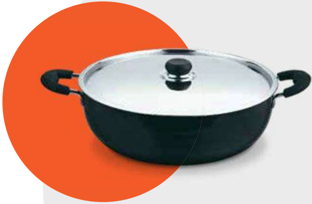
BLACK PEARL DEEP KADAI (WITH LID)