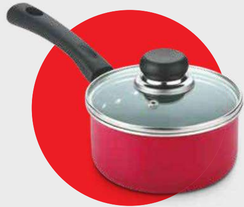
ZEST NON-STICK COMBO (SET OF 3) (INDUCTION-FRIENDLY)