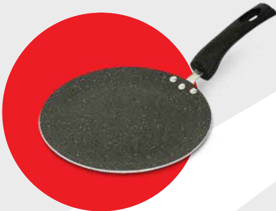
ZEST MARBILO CONCAVE TAWA (INDUCTION-FRIENDLY)