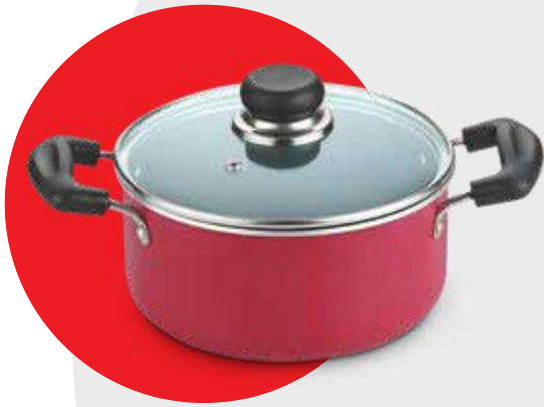
ZEST INDUCTO CASSEROLE (WITH LID/INDUCTION-FRIENDLY)