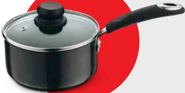
BLACK PEARL NON-STICK SAUCEPAN (WITH LID INDUCTION-FRIENDLY)