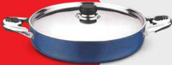
ZEST DEEP FRYPAN (WITH LID)