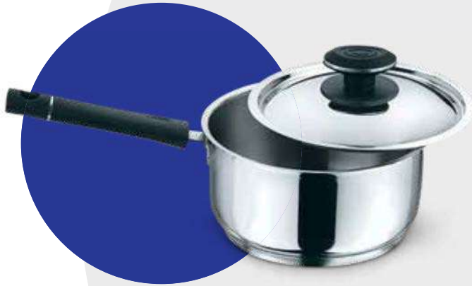
TIVOLI SAUCEPAN (WITH LID/INDUCTION-FRIENDLY)