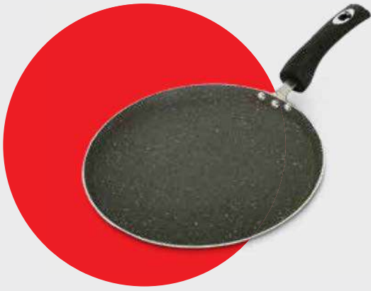
ZEST MARBILO DOSA TAWA (INDUCTION-FRIENDLY)