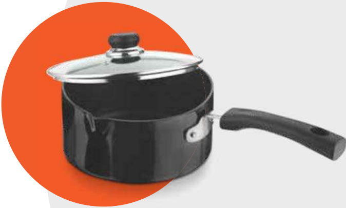
BLACK PEARL PLUS SAUCEPAN (WITH & WITHOUT LID/INDUCTION-FRIENDLY)