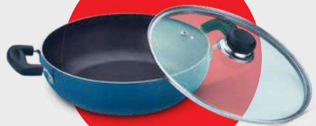
ZEST DEEP KADAI (WITH LID)