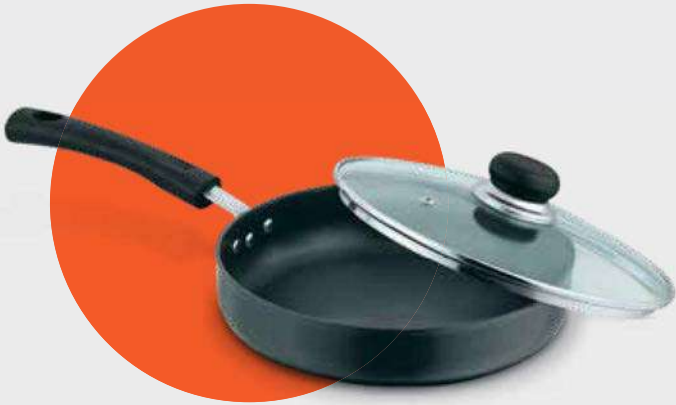
BLACK PEARL PLUS DEEP FRYPAN (WITH LID/INDUCTION-FRIENDLY)