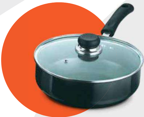
BLACK PEARL PLUS ALL-PURPOSE PAN (INDUCTION-FRIENDLY)