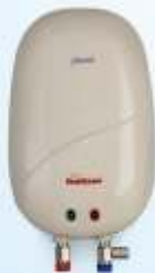
Instant Water Heater

4 star rating on 15L, 25L, 35L & 50L Models