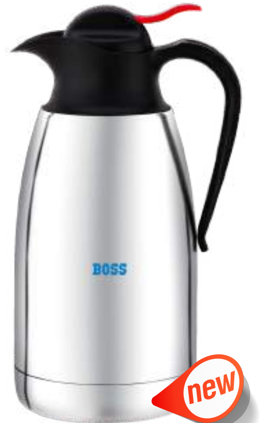
Model B-819 Capacity : 1500 ml