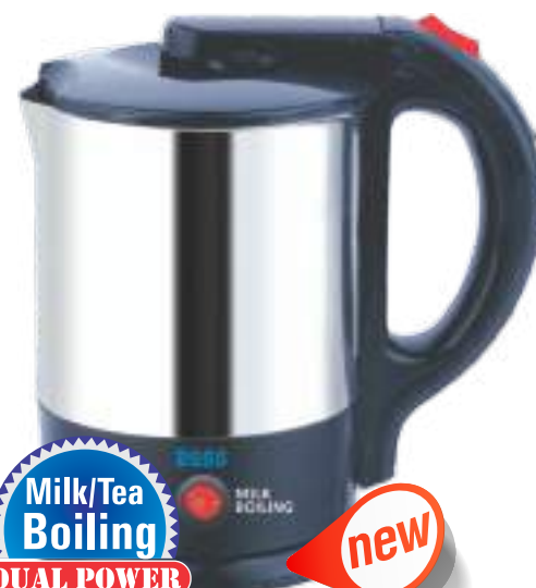
Model B-815 Capacity : 1.5 Litre