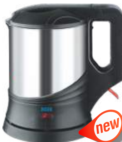
Model B-814 Capacity : 1 Litre