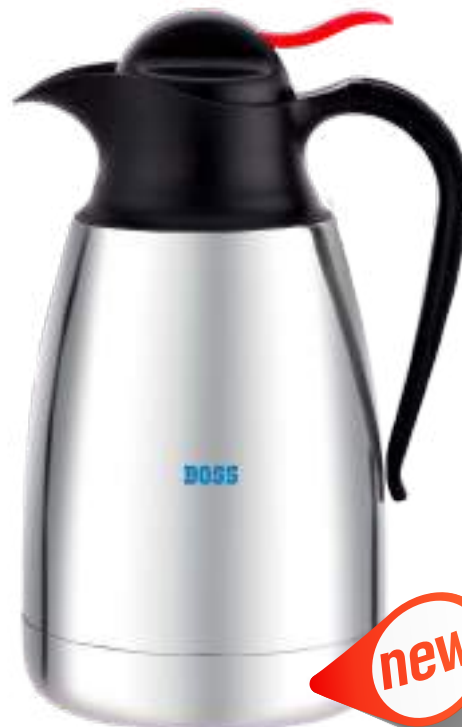
Model B-818 Capacity : 1200 ml