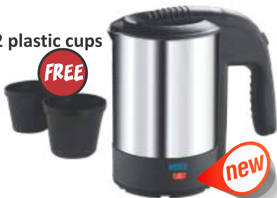
Model B-813 Capacity : 0.5 Litre