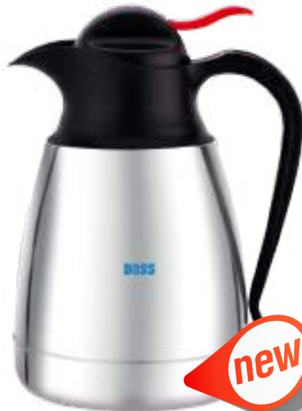
Model B-817 Capacity : 600 ml